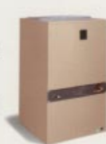
...with a standard single piece 10 SEER

The Stellar Series is engineered for energy efficiency compatibility with York indoor units, including York single piece, modular two piece, and variable-speed air handler. The Stellar unit can achieve up to 13 SEER efficiency when matched with a variable-speed air handler.