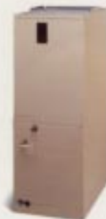
...two piece modular air handler up to 11 SEER