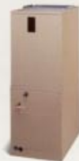
...with a variable-speed air handler up to 13 SEER